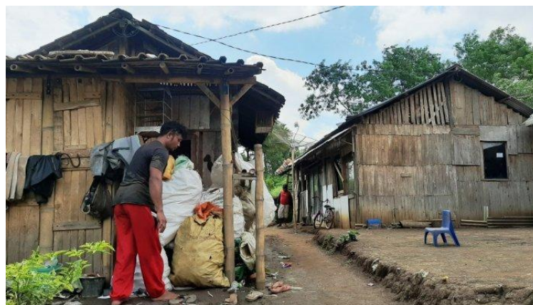
Picture 1. Kiringan Village scavenger community

One of the scavenger communities in Magelang City is in Kiringan, North Tidar Village, South Magelang District. Kiringan, which is inhabited by 18 families, is a village with semi-permanent houses where the people make their living as scavengers and daily search for scrap to make ends meet. The location of Kiringan Scavenger Village, which cannot be accessed by two-wheeled or four-wheeled vehicles, is one of the reasons why this village has not been touched by adequate community empowerment, and some groups actually consider Kiringan Village to be an area that has potential to add new slum areas to Magelang City. In reality, the presence of scavengers can contribute to waste management in Magelang City.